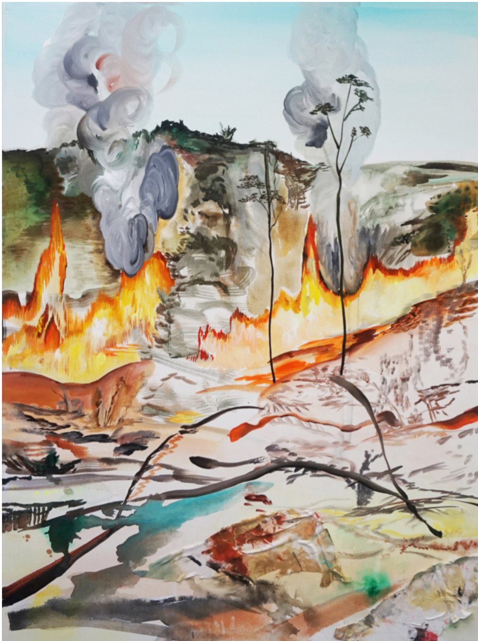
Amazon Dreaming, 2019, ink, acrylic, oil and torn clothes on canvas, 48 "x 36"

part of the rebuilding phase will be a great privilege and shouldn't be taken for granted. We're all needed for this task.