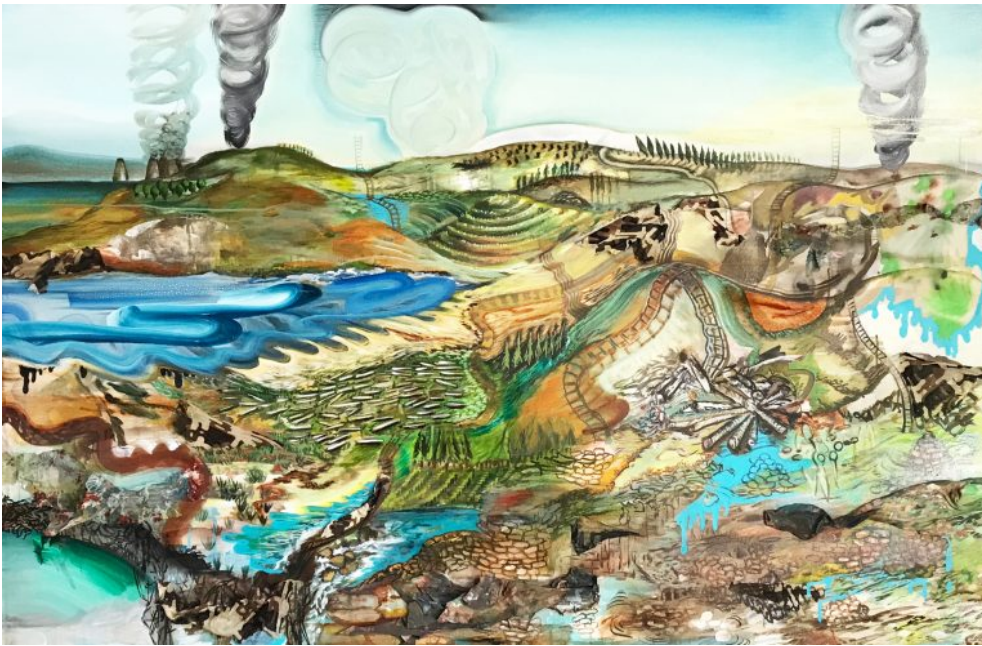
The Lost Path, 2019, ink, acrylic, oil and torn clothes on canvas, 48" x 72"

DW: Not dramatically, as during the financial crisis in 2008, I launched my own independent arts program, and confined my activities to our local area to keep life easy. It's challenging going to the studio not only because it's a shared space, but because my recent large pieces depicting natural disasters seem so prophetic with their sense of apocalypse. There's a feeling of everything falling apart both in the work and the sirens blaring outside. My schedule used to be packed with activities, but the overload, speed and juggling are gone. I'm reminded of the Shunryu Suzuki quote: "To live is enough." To adjust to this new reality, I've started a quarantine diary of writing, drawings and photographs.