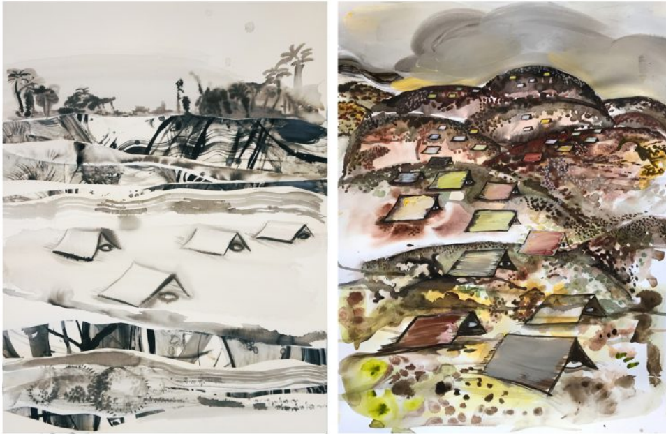
The eyes in the tents, 2019, ink and acrylic on paper, 30" x 22" each

of universal laws, Mother Earth and the animal kingdom has tragic consequences! I pray for a new worldwide consciousness, a new era that will be more just, enlightened, and aligned with the best of humanity.