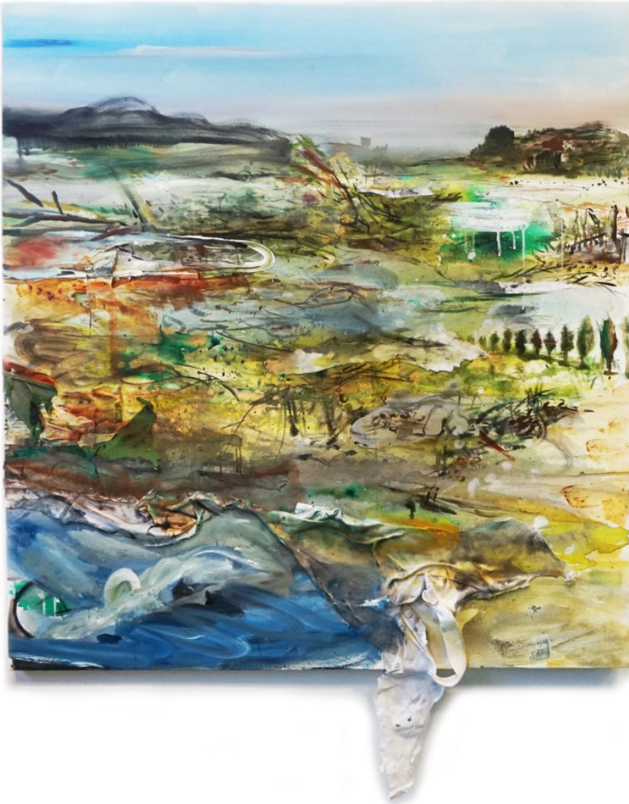
Deluge, 2018, acrylic, oil and torn clothes on canvas, 48" x 48"

I think mankind is undergoing a major shift towards creating a more just and enlightened society, but what if I'm wrong? What if this holocaust caused by stupidity, unfit leaders and careless nations has been in vain? What if all the sacrifice and pain has been for nothing? For better or worse, the world will never be the same. Somehow we must live day to day, waiting patiently to see how the global drama evolves.