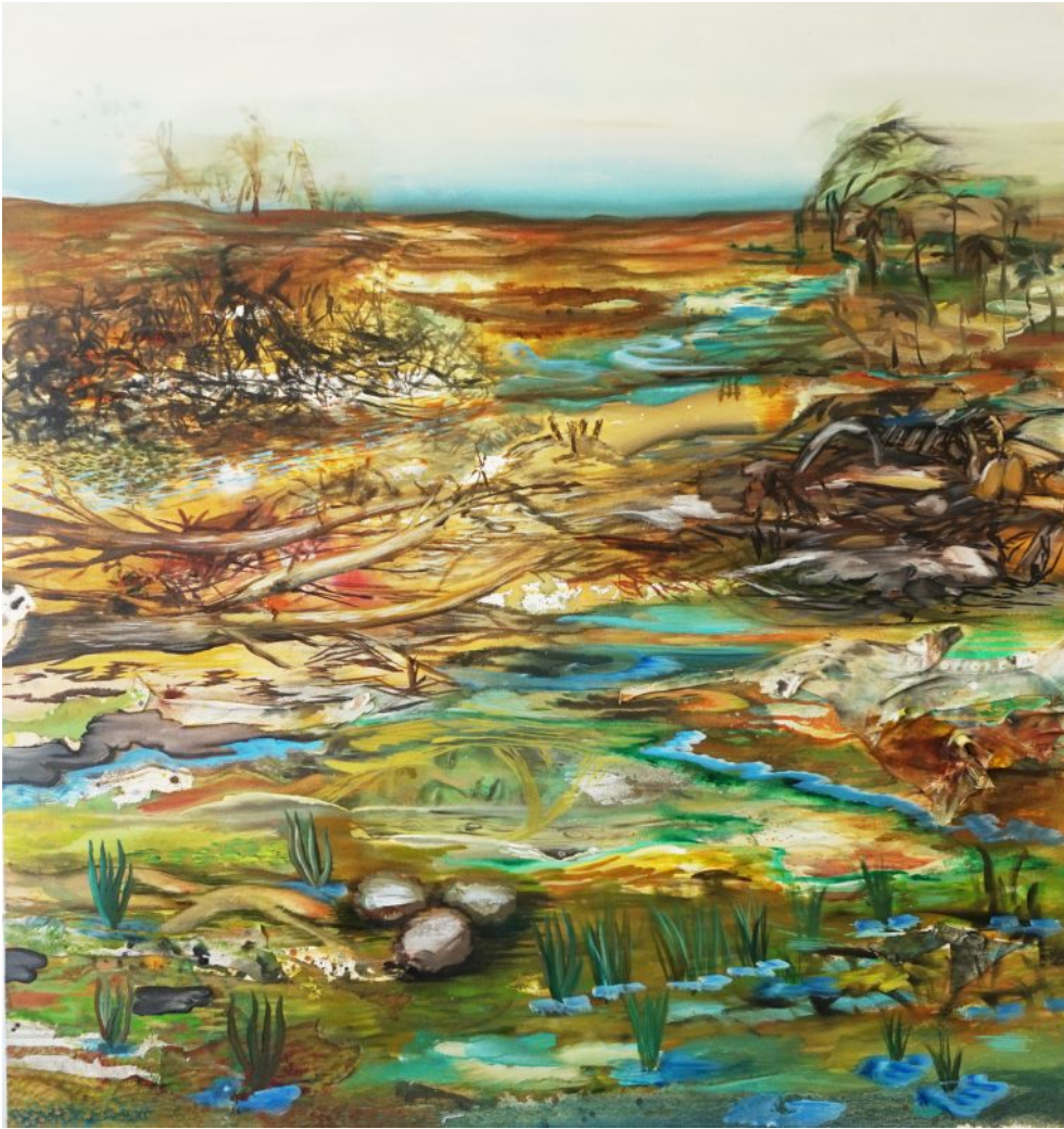
Terra Mater, 2019-2020, acrylic, oil and torn clothes on canvas, 48" x 48"

I went through a range of emotions and adjustments when my Su-Casa teaching gig was abruptly terminated, and my local arts program switched to online instruction. There's also worry over the loss of state grants, exhibition plans and income, but I count my blessings and try to focus on the big picture. Keeping my art classes running and educating young students boosts their mood and mine. One parent told me the only activity that truly engages her child during quarantine is art class! My family has also been cheerful and uplifting.